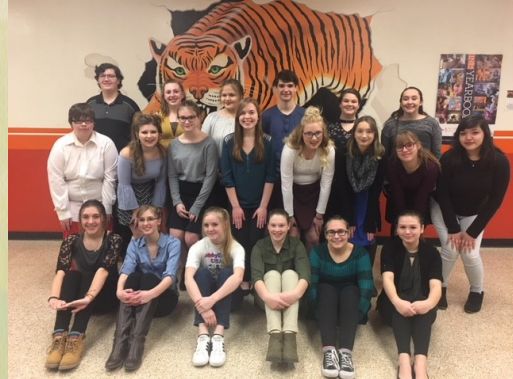
Individual State Qualifiers