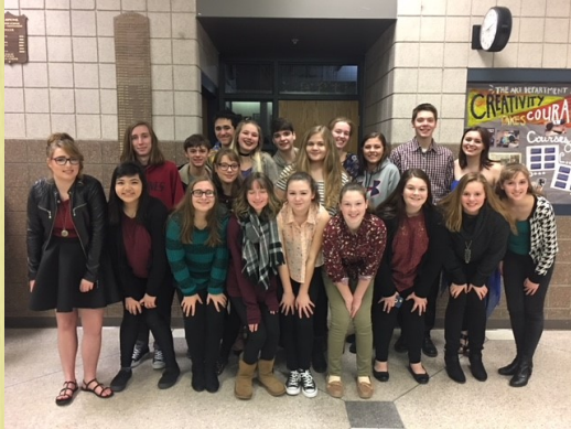
Large Group State Qualifiers