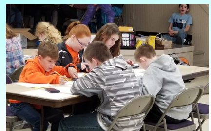
Math Bee Contestants