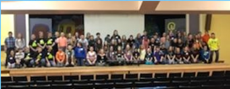
All participants in the 2018 Battle of the Books