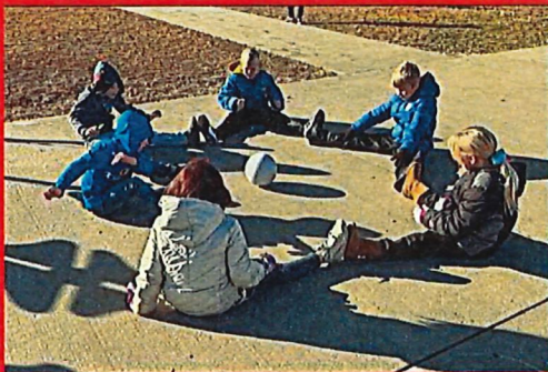
Enjoying the nice weather