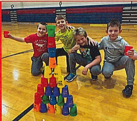
Second grade cup stacking